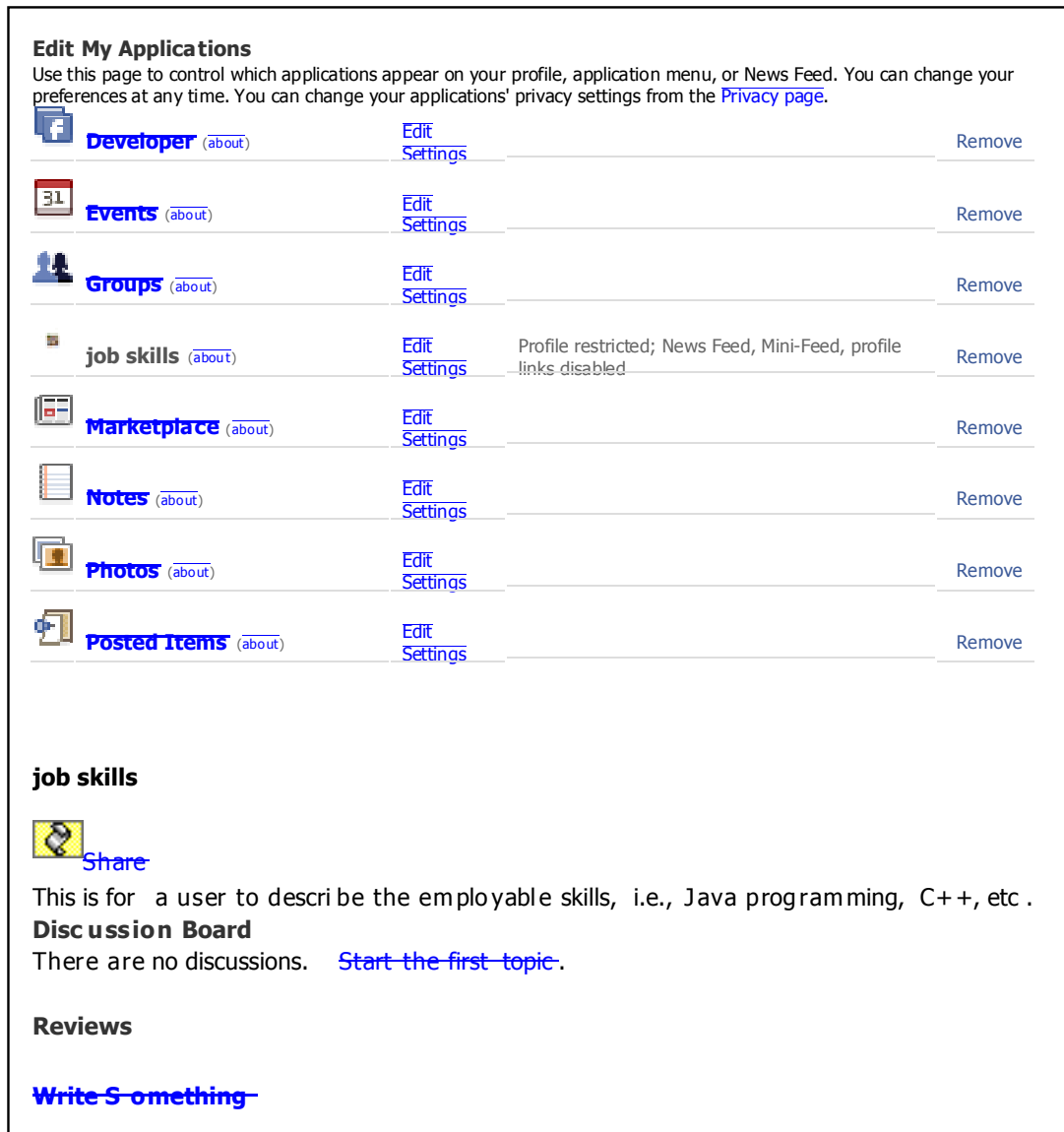
Figure 5. A screen capture of author's Facebook application page once the My Job Skills application is deployed.