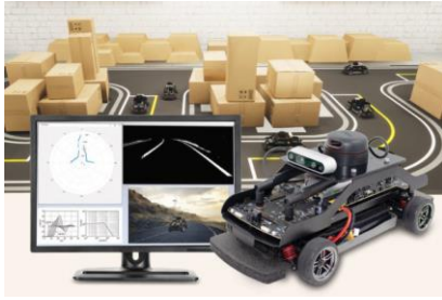
Figure 3: The Self-Driving Car Research Studio and QCar (TecSolutions, Inc., n.d.)

The enhanced feature of the kits like QCar have on-board computing (OBC) chip. These on-board computing chip also known as Artificial Intelligence (AI) Edge Chip or Edge Control boards. These chips/boards deployment of artificial intelligence (AI) and machine learning on the board (edge) called AI edge processing.