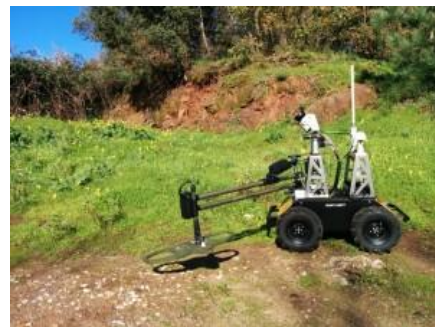
Figure 2: Coimbra's Mine Detection Robot (Hennessey, M., 2015)

These kits with expanded functions and features at the software or hardware levels, can be implemented or converted into real/practical world scenarios for example in detecting land mines, explosives etc.