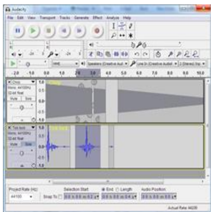
Figure 2: Audacity Sound Recording

Audacity provides detailed training manuals which will explain each feature as depicted in Figure 2 below which shows a screenshot of sound being recorded using the software. Tutorials are available in multiple languages and support is provided.