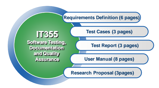
Figure 3 IT 355 Writing Assignments

IT355, Software Testing, Documentation, and Quality Assurance, also includes practical experiences with preparing documentation in each phase of the system life cycle. It covers knowledge and skill of software testing, which is much requested by potential employers. The summary is shown in Figure 3.