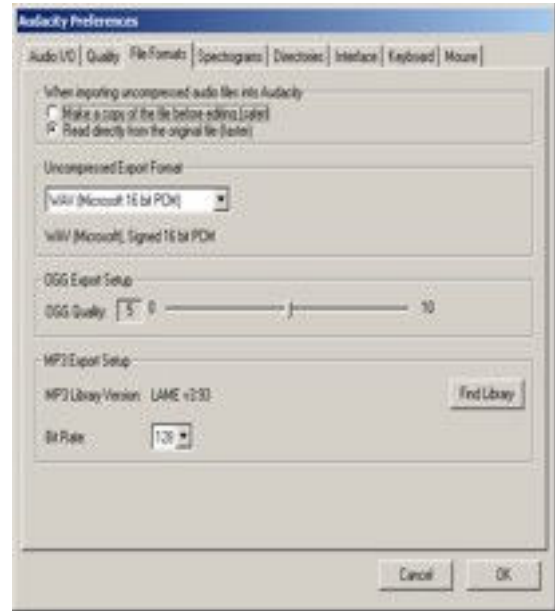
Figure 3: Audacity Preferences

Before saving the files, check the MP3 export settings. In Audacity, this is found in the application preferences: