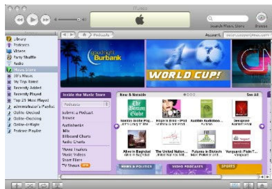
Figure 4: iTunes

There are times when a wider distribution through commercial sites may be desired. The music distribution service offered by Apple, iTunes, provides a mechanism for free distribution of podcasts.