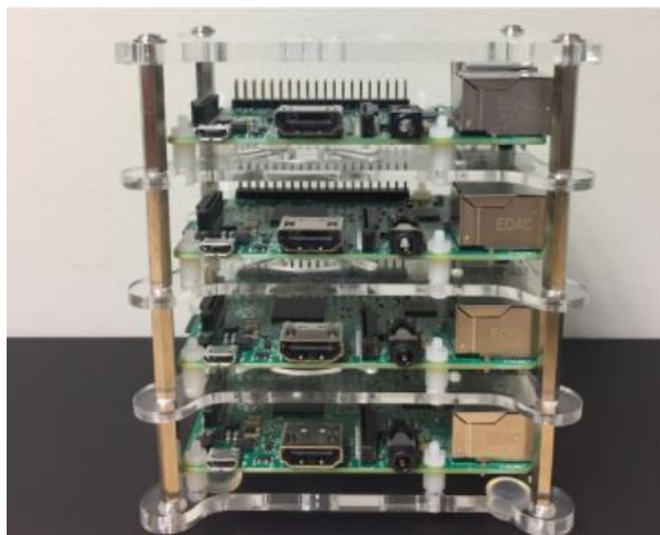
Figure 1. Raspberry Pi Enclosure

A Raspberry Pi device stores secondary data on one microSD card. The Raspberry Pi Foundation recommends using an 8GB SD card, but 16GB cards were used for this cluster to ensure ample storage space (Raspberry Pi Foundation, n.d.d). These cards must be formatted using FAT file