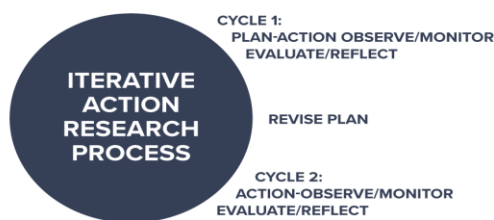
Figure 1: Iterative Action Research Process