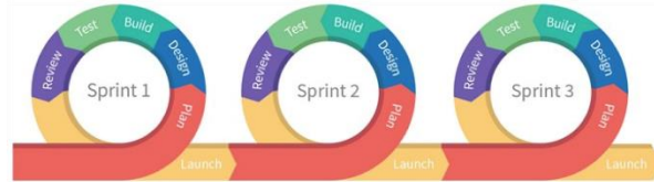
Figure 2: Agile Learning Process

I propose the term agile learning to refer to the application of the processes and principles of agile software development to the context of learning. Agile software development is characterized by short development cycles, called sprints, in which a working software application is fully planned, designed, built, tested, reviewed, and launched (Anand & Dinakaran, 2016; Matharu et al., 2015). Through several sprints, developers iteratively expand and improve the software application. In the context of learning, development cycles and working software applications are replaced by project cycles and useable deliverables, respectively. In other words, an agile learning experience consists of multiple short project cycles, called sprints, in which a useable deliverable is fully planned, designed, built, tested, reviewed, and launched. One of the defining features of agile software development – and by extension agile learning – is the fact that each sprint ends with a useable deliverable that is increasingly being expanded and improved upon. Although originally introduced in the early 2000s, agile software development only became widely adopted in the last few years (Anand & Dinakaran, 2016). Figure 2 depicts the agile learning process.