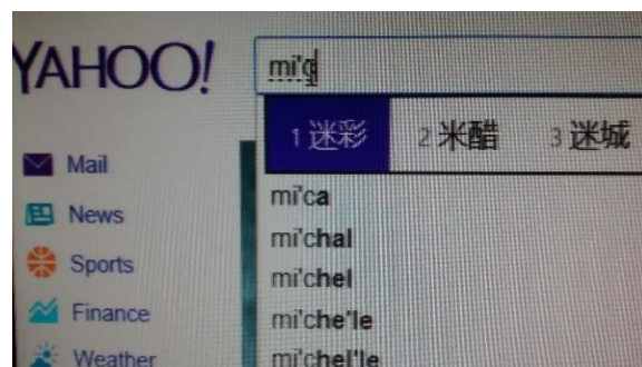
Figure 1: Browser Search Automatic Chinese Translation

systems and application software will likely be in the local language. While the classrooms had both English and Chinese operating systems and software installed, the students often used the Chinese version. This can be challenging when attempting to assist students with problems, particularly error messages. Ideally, all students would use the English version but some students really struggled with English and were more comfortable using the Chinese version. As such, we did not require them to use the English version. Obviously, the icons are the same and if you are familiar with the software it is possible to navigate fairly well with some translation assistance from the students. Even the English version of the software would frequently try to translate what was being typed to Chinese, making modifications to PowerPoints on the fly and web searches challenging (see Figure 1). The automatic translation adds single quotes as you type and translates to Chinese characters.